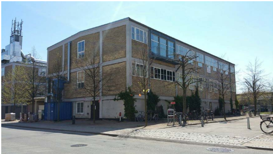
Fig. 1. Building 155- KADK Copenhagen

Assemblies' temperatures are not derived from energy simulation; this is because predictions are roughly averaged by the full extent of a surface. Boundary conditions such as the temperatures at internal surfaces were defined in the CFD tool, which account for both the effect of short and long wave radiation. Other boundary conditions such as film coefficients were derived from literature.. Some of the environmental conditions (i.e. outdoors temperatures, air velocity and direction) were extracted from an EPW weather file which was compiled on the base of data gathered by an onsite weather station. Before running a CFD analysis, the geometry was automatically meshed by the CFD tools into small pieces called elements. Meshing is an important feature that is facilitating the adoption of CFD in architectural design. It simplifies set-up of analysis models resulting in less time spent assigning mesh sizes. The quality and number of elements have direct impact on the computation time and soundness of the analysis results'. CFD experiments were carried out to simulate variables of indoor air before/after installation or removal of partitions. Every steady state analysis had required multiple iterations before convergence (500 to 700 iterations depending on the scenario).