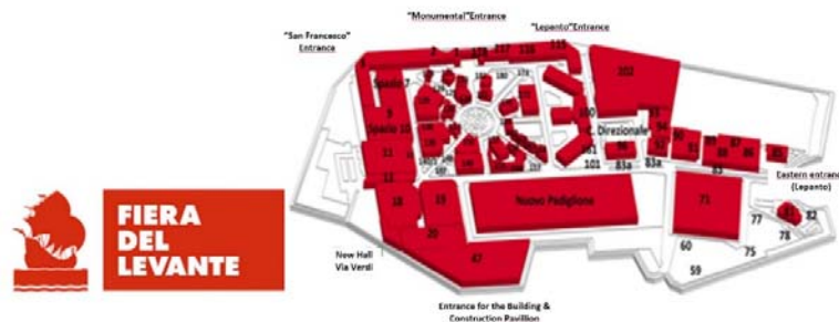
Fig. 1. Schematic plan of the Exhibition District “Fiera del Levante” in Bari, Italy.

The Fiera del Levante (Fig.1) is here thought as a living system, where structures and infrastructures are correlated to form subsystems which live autonomously, and interact when it is necessary. Management rules for use of spaces and fittings, service supply, building maintenance, use of plants and utilities form the “welcome features” of the FdL system. Finding their sustainable combination is not an easy job, considering that it severely affects the satisfaction of the end users. How to manage existing building assets, as well as how to guarantee the regular course of all the contemporary activities in the presence of thousands of visitors makes the decisional task a complex and slicky one.